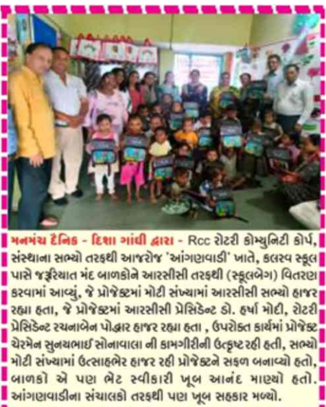
Distribution of school bags to the students of Suthiapura Anganwadi