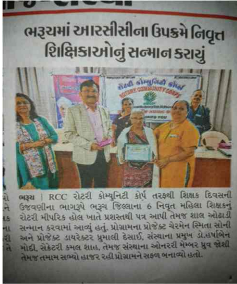
Honour of Senior citizen lady teachers on Teacher's day