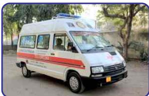
Ambulance & Morgue Vehicle