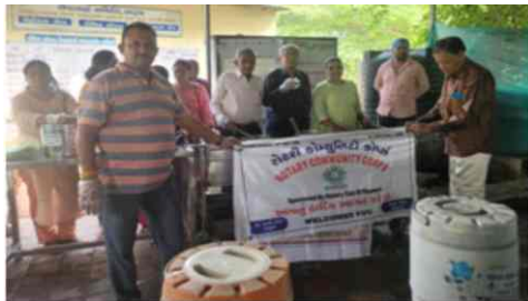
Lunch offered to Patients relative at Civil Hospital