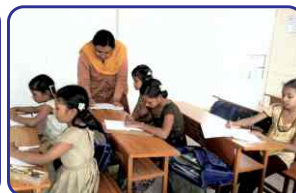
Hum Honge Kamyab - Literacy