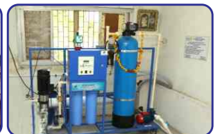
Clean Drinking Water