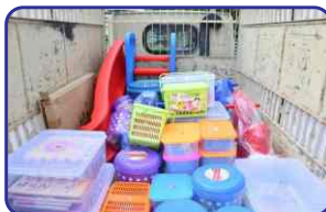
Mobile Toy Library - Ramakdu