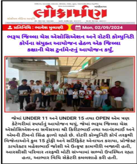
Competition of Chess Tournament