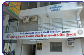
P.D. Shroff Rotary Diagnostic Center