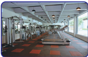
M. I. Patel Rotary Youth Center