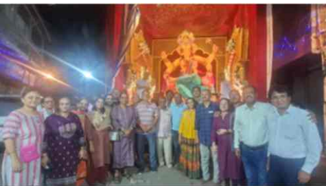
Lord GaneshMaha Aarti at Junabazar by RCC Members