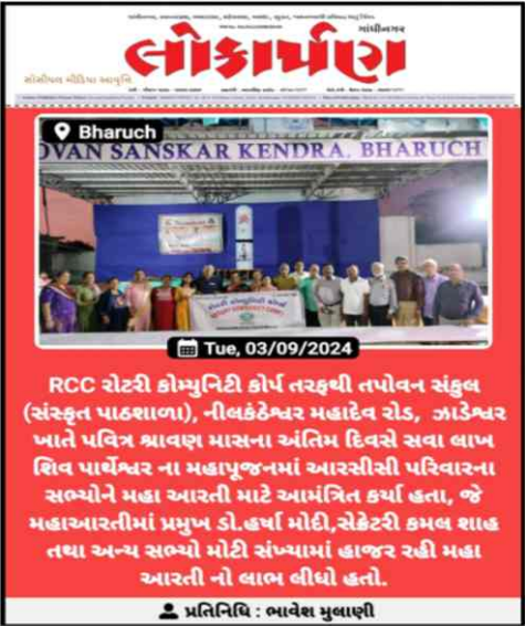
Maha Aarti at Sanskrit Pathshala