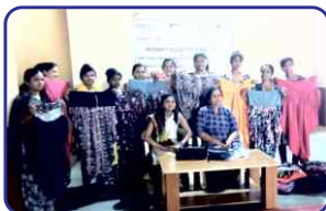
Women Empowerment Project