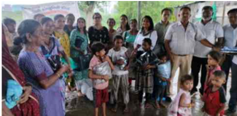
Clothes distribution to needy people at Mahavir Nagar