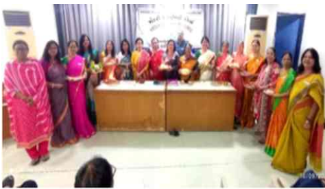
Competition of Aarti decoration and Modak